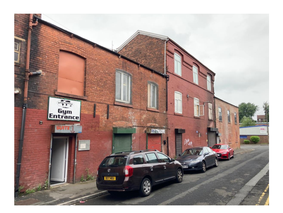
Photo 6: View of site, and existing gym entrance, viewed from Lord Street

Photo 5: View of side of building viewed from Lord Street